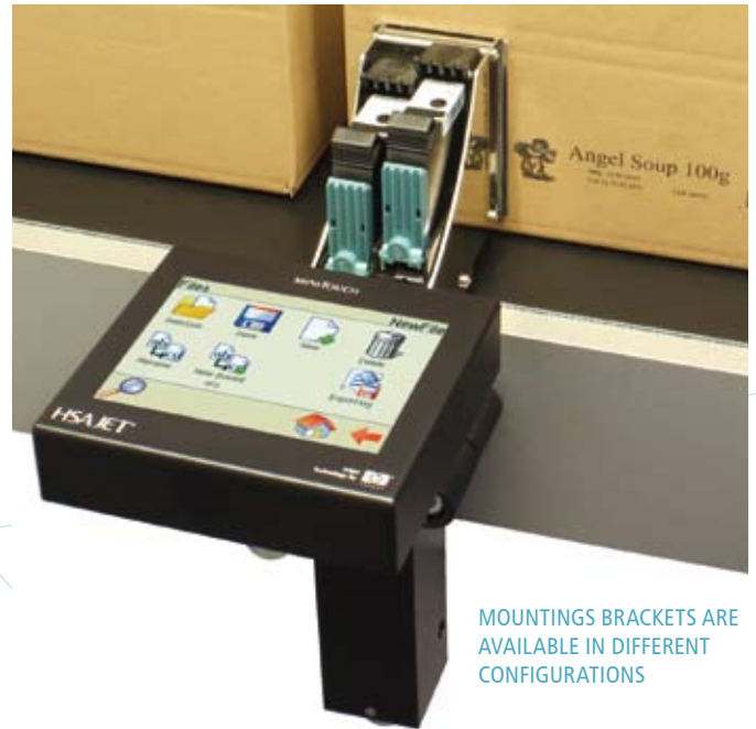
MOUNTINGS BRACKETS ARE AVAILABLE IN DIFFERENT CONFIGURATIONS