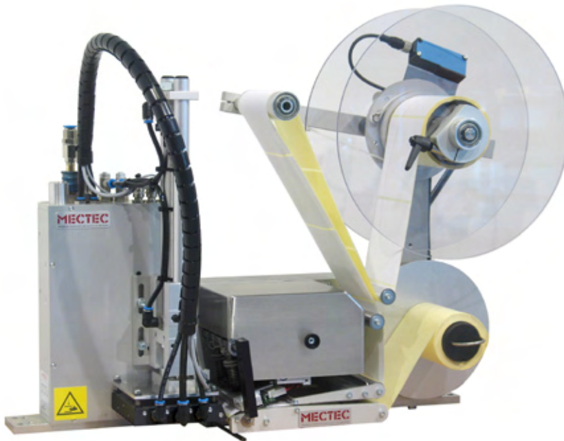
Printer and applicator in right hand version