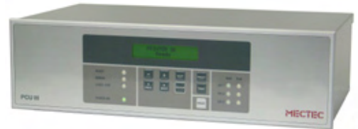
Printer Control Unit PCU III