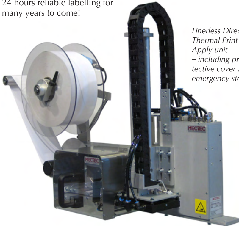
Linerless Direct Thermal Print & Apply unit – including protective cover and emergency stop

The Linerless printer has the reliable, robust and easy to use design - as seen on all the Mectec family machines. It is proven to give you 24 hours reliable labelling for many years to come!