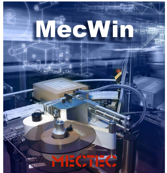
The startscreen when you open MecWin 4.0

In MecWin 4.0 you can view and edit several labels simultaneously – and also cut and paste between them