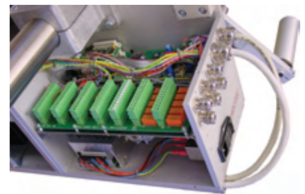
Controller and I/O:s easy accessible