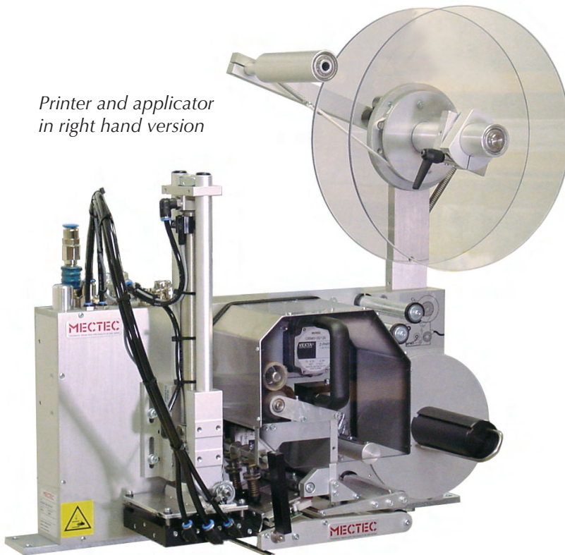
Printer and applicator in right hand version