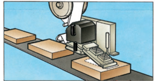
Box and parcel labelling. Applies on moving products!

The TWR100 has the reliable, robust and easy to use design - as seen on all the Mectec family machines. It is proven to give you 24 hours reliable labelling for many years to come - even in the most harsh industrial environments!